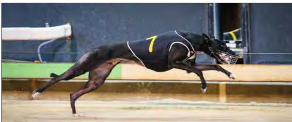
Cairnlea Kenny winning the National Sprint SA Final.