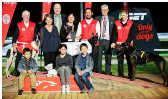
Last year's winner Black Bombshell.

Heat 3 [Race 9 – 9.38pm] What a match up this heat promises to be with Victorian Blue Shadows for Angela Langton taking on