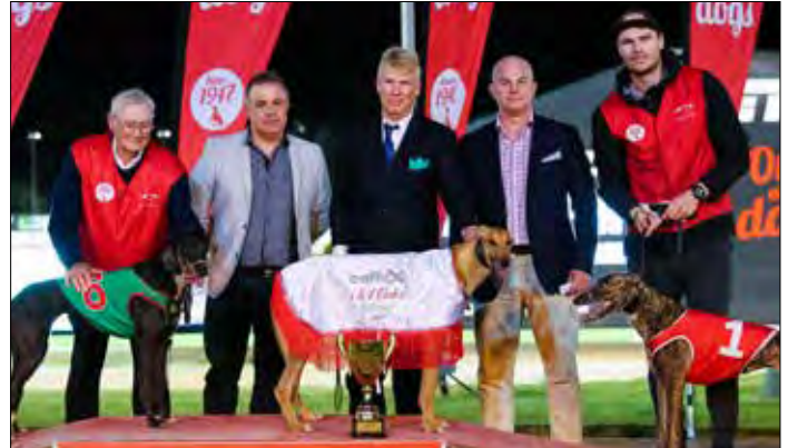
Last year's winner Hoo Gur Affair.

Heat 3 [Race 10 – 9.57pm] Weblec Nic is the most inexperienced