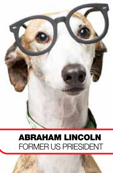
ABRAHAM LINCOLN FORMER US PRESIDENT