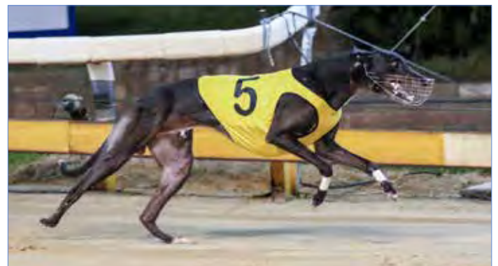
Zippping Zeus winning Heat 1 for Tony Rasmussen.

The $8,640 Final is always a highlight of the racing calendar.