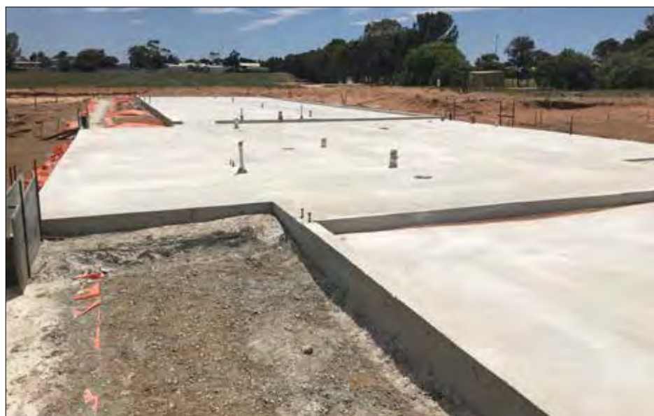
Concrete slab for the kennel house.