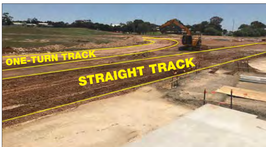
View from patron building to the finishing post and first corner.

Racing will be conducted over four racing distances – 395 metres, 455 metres, 530 metres and a staying trip of 680 metres. There will also be