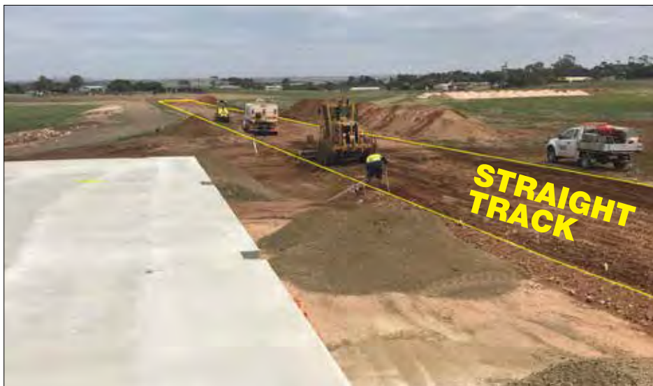
View from the patron building looking down to the start of the straight track.

The track will be seven metres wide and have racing distances of 300 and 350 metres, with the final lure system design yet to be confirmed. Options for the lure system include an arm on a rail, powered either by cable (Angle Park) or self-propelled (Gawler), or a drag lure.