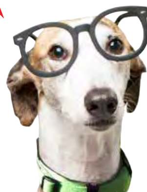
ALBERT EINSTEIN Theoretical physicist