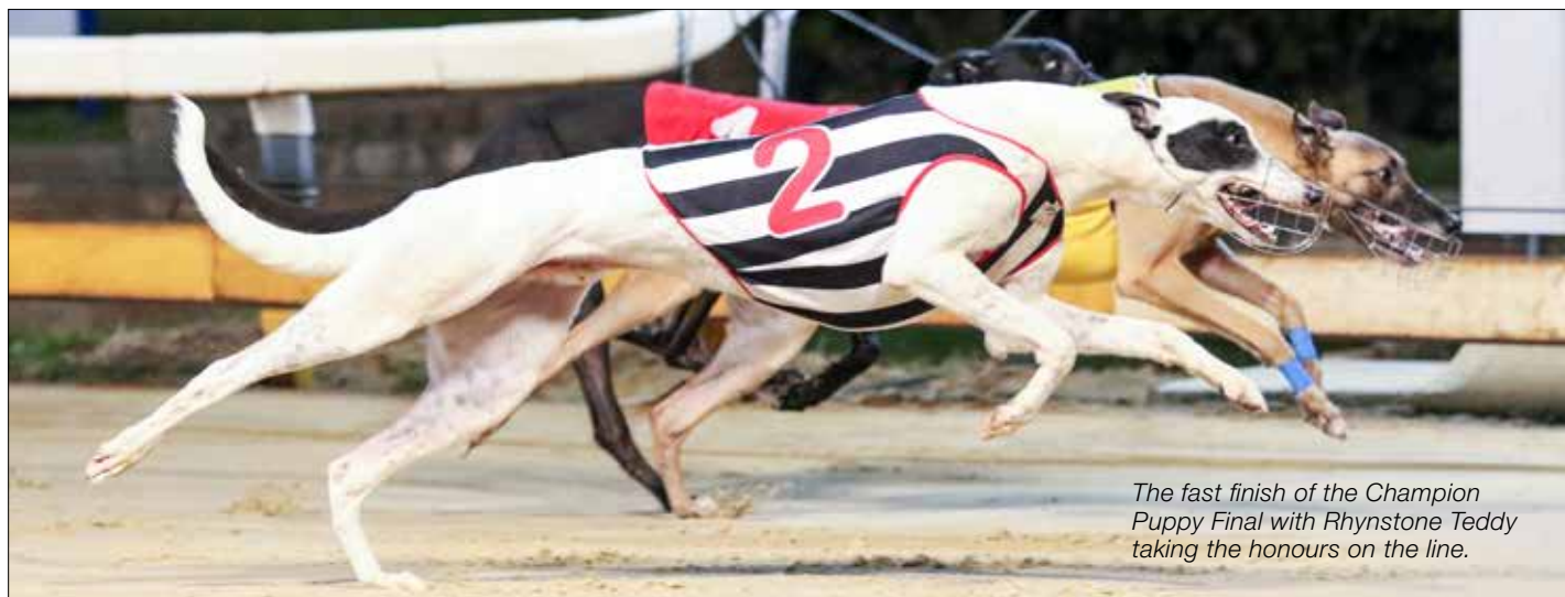
The fast finish of the Champion Puppy Final with Rhynstone Teddy taking the honours on the line.