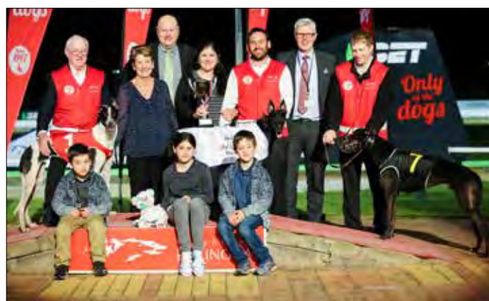
Black Bombshell won last year's Derby Final.