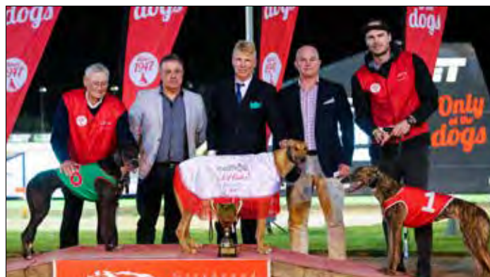
Hoo Gur Affair won last year's Oaks Final.

• Nominations for the heats close Monday, 10th September at 9.00am.