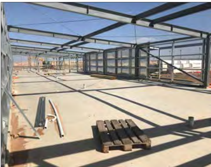
View from patron building