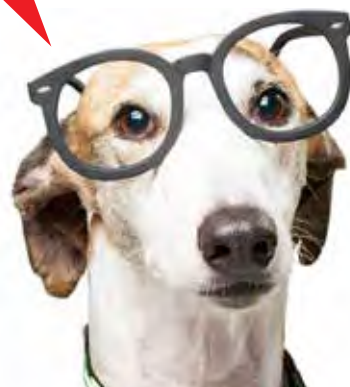
CHARLES R. SWINDOLL

LIFE IS 10% WHAT HAPPENS TO YOU AND 90% HOW YOU REACT TO IT.